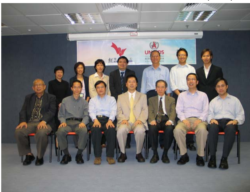
Fig. 5. The Red Ribbon Centre Management Advisory Committee and the HIV Prevention and Health Promotion Team of SPP (2006)