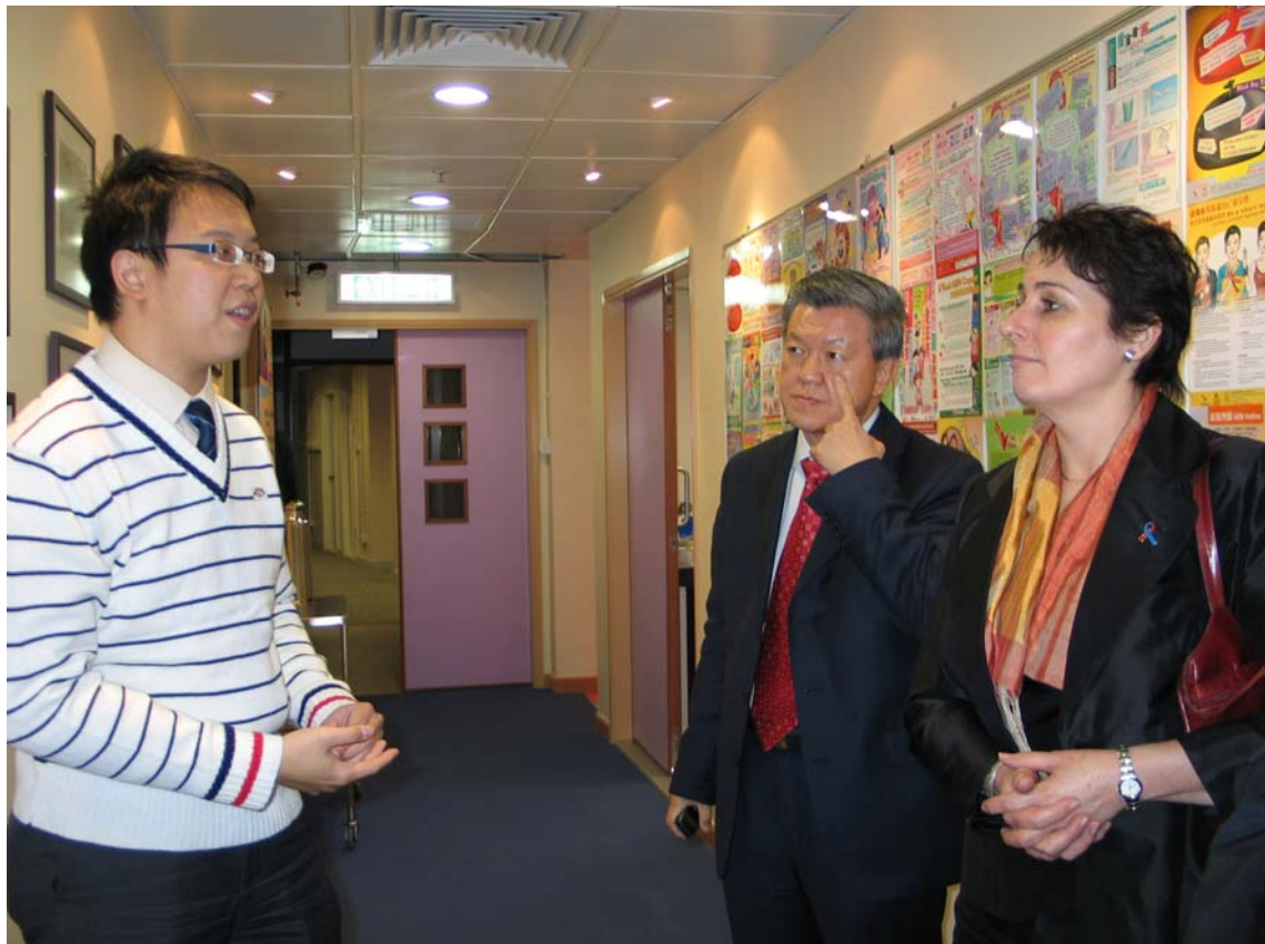
Fig. 7. Malaysian Minister of Health, Datuk Dr Chua Soi Lek visited UCT in December 2005.

The participations in International AIDS Conference (IAC) and International Congress on AIDS in Asia and the Pacific (ICCAP) were always one of the main focuses of UCT. We attended and presented our experiences in planning and conducting programmes on HIV prevention and management every year (Fig. 8). In Aug 2006, we helped in organising a skills building workshop titled “What do PLWHA really need? Scale up HIV/AIDS management and rehabilitation” in the XVI International AIDS Conference in Toronto.