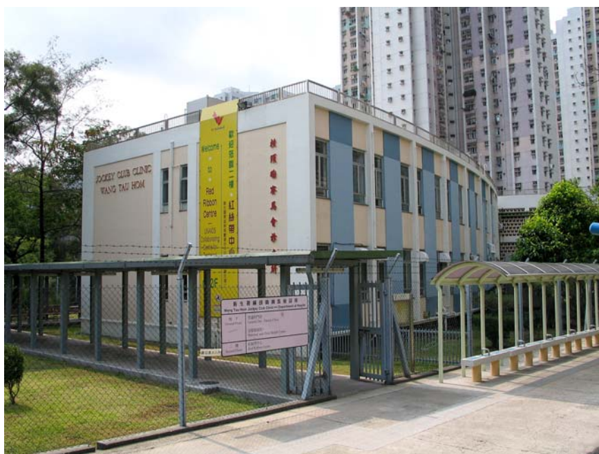
Fig. 1. The Red Ribbon Centre