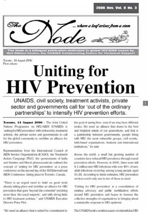
Fig. 17. The Node

Beginning March 1999, a periodical "The Node" has been published regularly to update on the activities of the UCT programme. Twenty-four issues have been published up to the end of the year 2006 (Fig. 17).