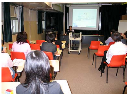
Fig. 6. A talk delivered by a Lions Red Ribbon Fellow

In 2003, the upper limit of successful applicants has been raised to 12. Usually, six units, consisting of 1 to 2 individuals each, will be sponsored to join the Scheme every year. In 2006, this programme has been running into the 8 th year, we saw a record number of 14 Lions Red Ribbon Fellows completed their study. As of the end of the year 2006, a total of 51 fellows have completed the studies in Hong Kong. The details are listed in Annex C.