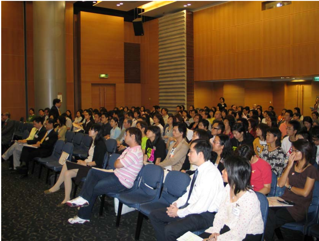
Fig. 11 and 12. About 300 HIV workers from Hong Kong and cities in the Pearl River Delta region participated in the Hong Kong AIDS Dialogue 2006.