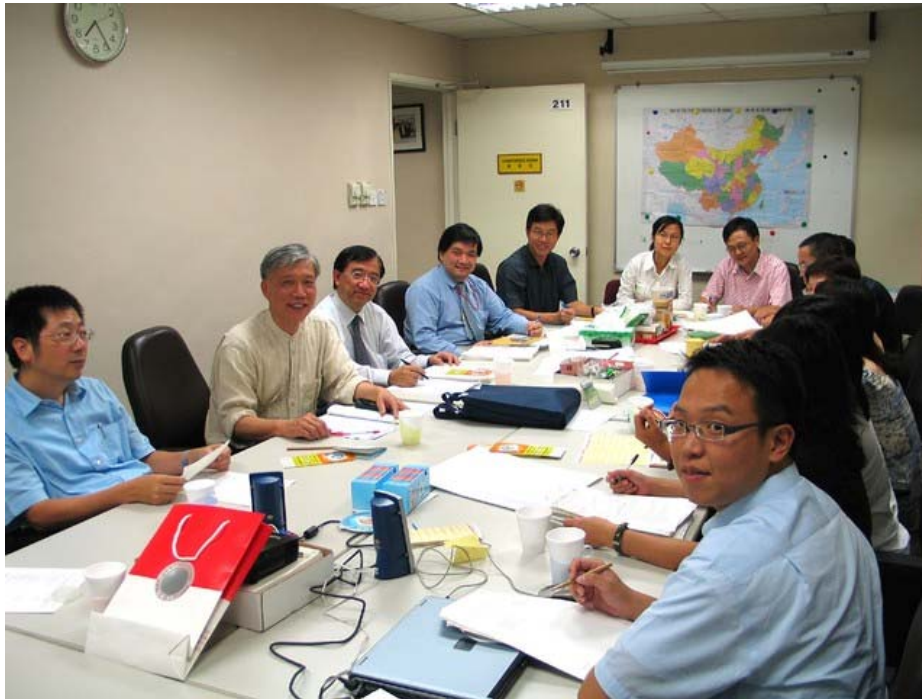
Box 2. The Red Ribbon Centre Management Advisory Committee at work, with visitors from Sichuen, Beijing and Henan in attendance.