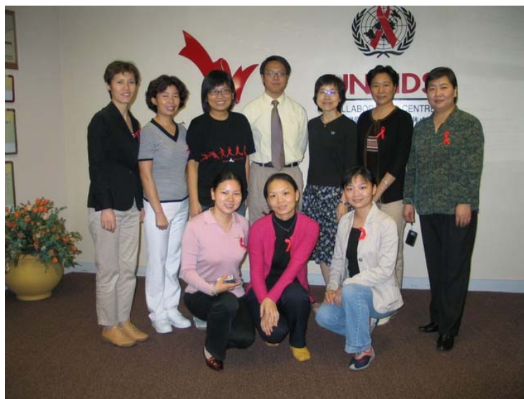
Box 9. Visitors from Henan during their visit and staff of Red Ribbon Centre in 2004

significant proportion of visitors had come to take reference from both the HIV prevention activities at Red Ribbon Centre and the territory's methadone clinics.