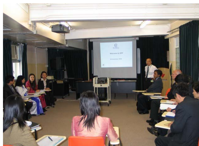
Box 8 (a). Workshops for Delegates from Mainland China, 1999 – 2004