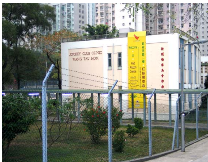
Box 1. The Red Ribbon Centre

Red Ribbon Centre (Box 1) has since been the base of the HIV Prevention and Health Promotion Team of the Special Preventive Programmes. In 1998, the Advisory Council on AIDS conducted a review on the AIDS programme and situation in Hong Kong. The review process has alerted AIDS programme individuals of the international responsibility Hong Kong might or could play in the fight against the global epidemic. On 8 May 1998, Dr Peter Piot, Executive Director of the Joint United Nations