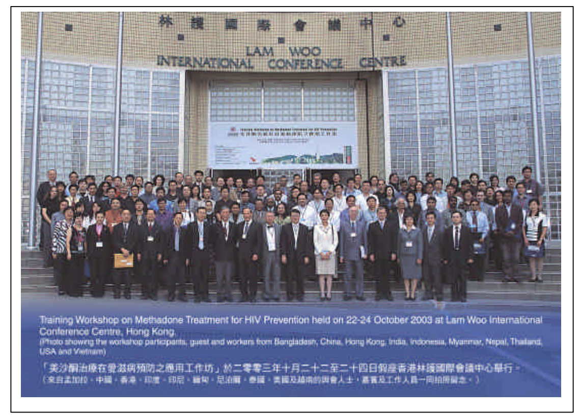
Box 11. Participants at the Training Workshop on Methadone Treatment for HIV Prevention

The first course had been scheduled to begin in 2003 but was postponed indefinitely because of poor responses from potential applicants.