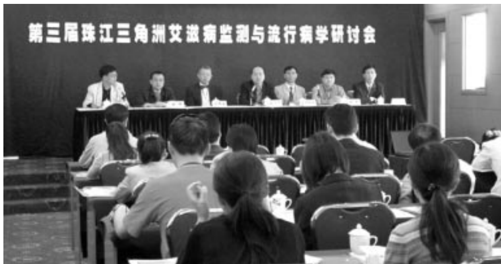
The Third Workshop on HIV Surveillance and Epidemiology in the Pearl River Delta Region was held in Shenzhen between 7th and 9th of November 2002.