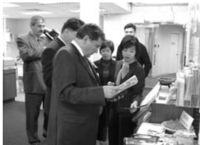
Staff of Red Ribbon Centre introduced various resource materials to the delegates.