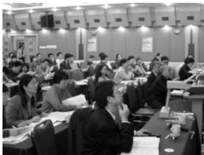
The delegates of the 13 participating cities provided detail account on the recent trends of HIV situation in their local cities during the workshop.

Our way forward should therefore build on the existing information sharing structure. One option is to design a framework to ensure timely data collection and deliverance of information to those required to know. Most importantly, this framework will rely on the regular input of HIV prevalence data from cities in the region. It will capture only currently available routine HIV prevalence information. Whether the data should be deposited on a common accessible area in the Internet or by other means could be worked out among all participants in the future.