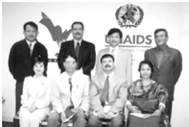
Sponsored by the Family Health International (FHI), a delegation from Nepal visited Hong Kong and shared the Hong Kong experience of harm reduction with a view of implementing a new harm reduction programme in Nepal.

HIV epidemic in different population tells a different story related to its own background and routes of transmission. In Nepal, where the HIV/AIDS epidemic is relentlessly fuelled by the high proportion of needle-sharers among the injecting drug users (IDU), Family Health International (FHI), which is an international non-government organisation, has coordinated a number of harm reduction works for IDU on AIDS prevention. The organisation had sponsored a delegation from Nepal to visit Hong Kong from 11 to 15 November 2002. The aim of the visit was to share the Hong Kong experience of harm reduction for IDU, with a view of implementing a new harm reduction programme in Nepal.