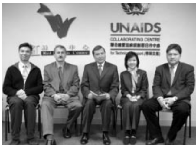
Organised by the Narcotics Division of the Security Bureau and Department of Health of the Hong Kong SAR Government, a delegation comprising key officials of the Ministry of Health from Uzbekistan visited Hong Kong to share the Hong Kong experience in tackling drug problems and HIV/AIDS.

The last but not the least, the delegation was reminded that there would be a regional workshop held in Hong Kong on the topic of "Training Workshop on Methadone Treatment for HIV Prevention" in April. With improved transportation, the world is getting smaller and Uzbekistan is no longer as far and remote to Hong Kong as it used to be. Many regional countries are expected to participate in the workshop and each and every one of them will enrich and season the experience sharing. The RRC are expecting some happy reunions with old friends from countries which had visited us before – now this would include our new Uzbek friends of course!