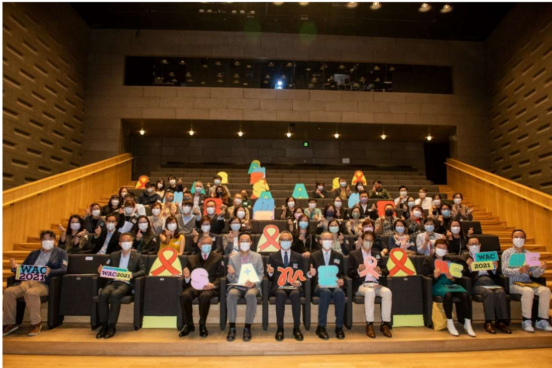
Group photo of the “World AIDS Campaign 2021 Kick-off Ceremony”