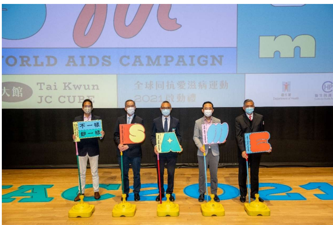
“World AIDS Campaign 2021 Kick-off Ceremony”