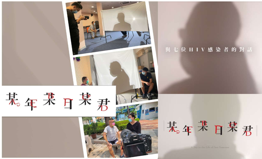
The picture of the documentary “A Day in the Life of Just Someone”