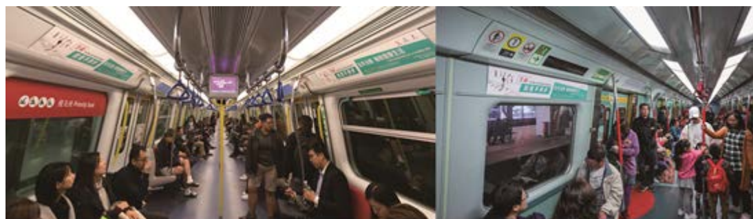
Advertisement in MTR