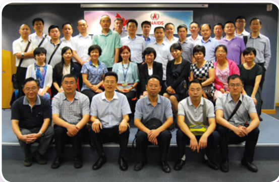
A study tour from Sichuan visited on 7 August 2014