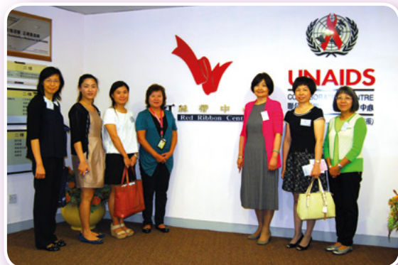
Visitors from Guangdong Province Health and Family Planning Commission on 8 August 2014