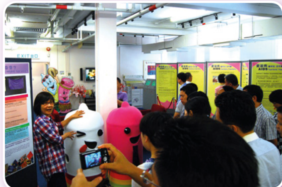
A study tour from Sichuan visited on 7 August 2014