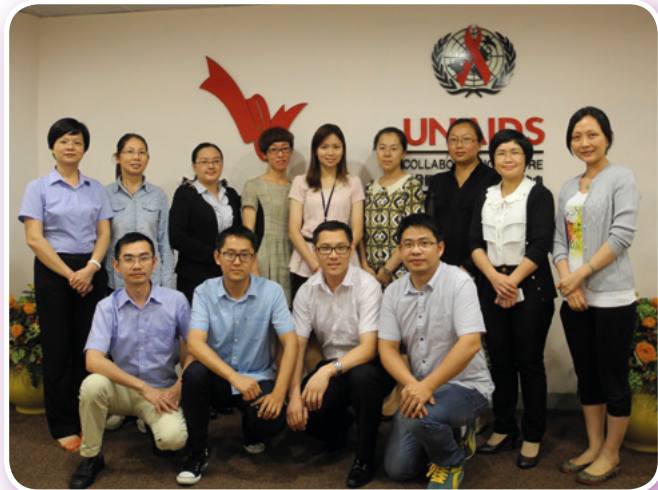
Representatives from Guangdong Field Epidemiology Training Programme on 29 May 2014

Red Ribbon Centre received visitors from the Mainland and overseas agencies, and provided a platform to enhance the collaboration between local workers and overseas counterparts in HIV prevention. There were totally 239 visitors in 2014