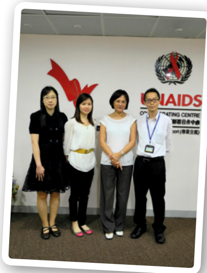
HIV/AIDS and STI team of WPRO visited Red Ribbon centre on 20 August

There was one Lions Red Ribbon Fellows in 2013. The Fellowship Scheme is mainly aimed at experience sharing between Mainland China and local workers, to enhance technical exchange on HIV prevention, and encourage collaboration and networking.