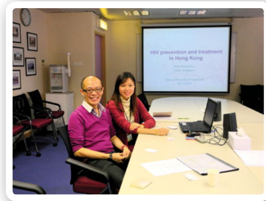
Visit programme for Singapore Delegation on 2 December