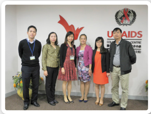
A study tour of four representative from the Ministry of health and Ministry of Finance of Vietnam, sponsored by WHO, visited the Red Ribbon Centre on 14 November 2013

Red Ribbon Centre received visitors from the Mainland and overseas agencies, and provided a platform to enhance the collaboration between local workers and overseas counterparts in HIV prevention. There were totally 306 visitors in 2013.