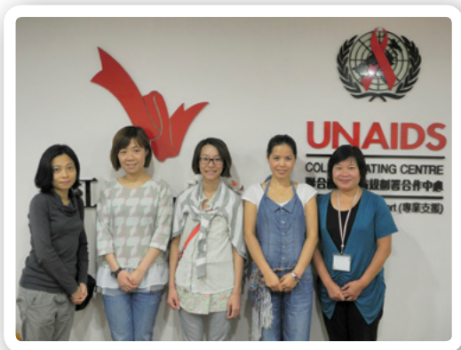
Clinic attachment programme for Fellowship in Clinical HIV nursing from China on 13 October