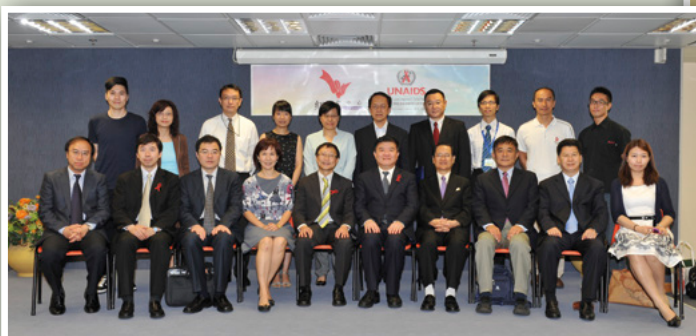
国家卫生部陈竺部长及其代表团 到访红丝带中心 (摄於二〇一一年六月八日)