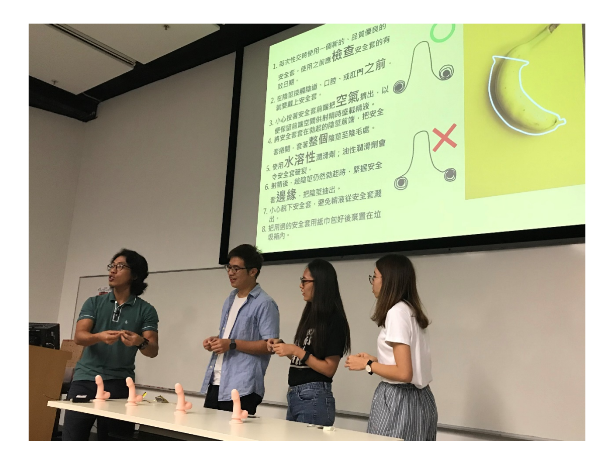
Figure 1. Students participated in condom demonstration.