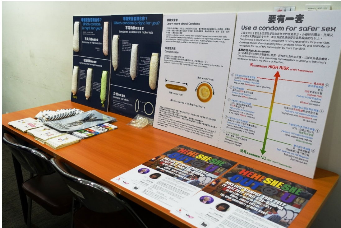
Figure 2. Condom demonstration carried out by nurse.