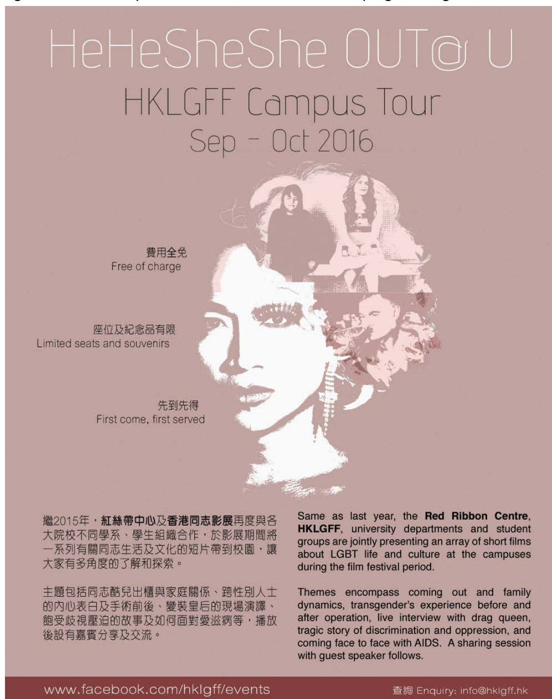
Figure 1. Poster and print advertisement in the HKLGFF programme guide.